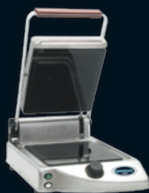
XP 010 P