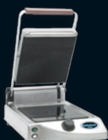
XP 010 PR