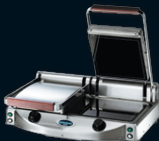
XP 020 XP 020 P