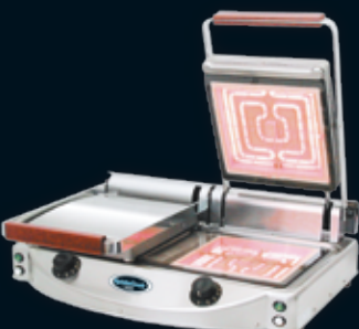
XP 020 T XP 020 PT