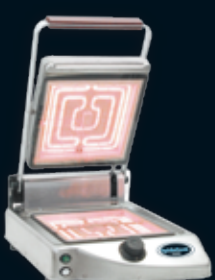
XP 010 PT